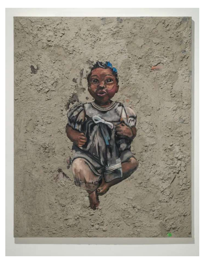
A painting by Collins of that same doll. (Lindsey Brittain Collins)

The series features painted images of the dolls surrounded by concrete. Over time, as the concrete crumbles, the painting beneath it becomes more visible. It becomes unearthed.